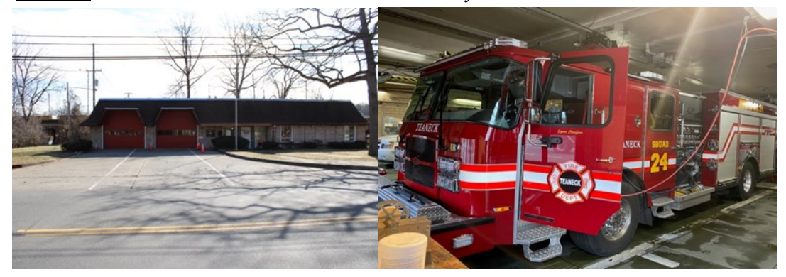
Station 4: 1775 Windsor road: Built in 1968 currently under a renovation.