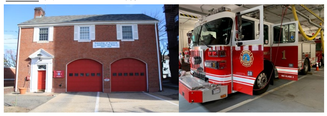
Station 2: 617 Cedar Lane: Built 1953