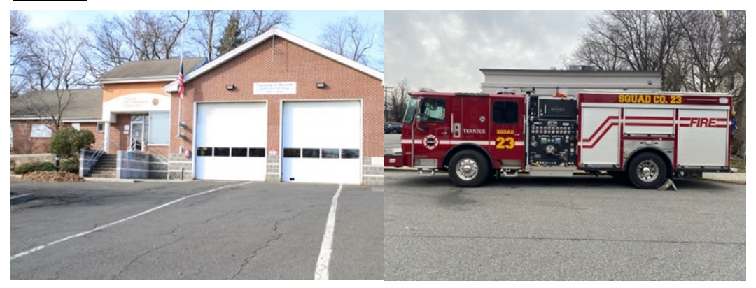
Station 3:370 Teaneck Road: Built 1990